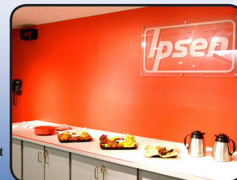
Ipsen U Breakfast